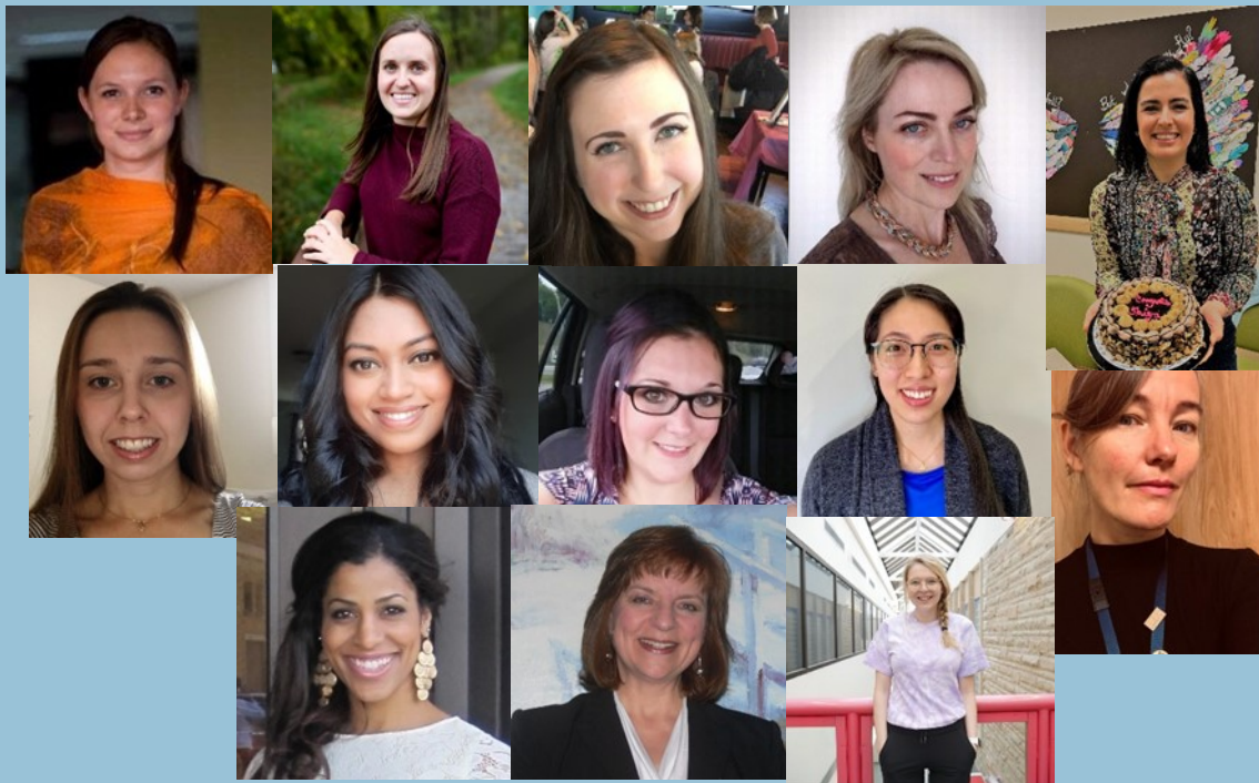
West 5 th Occupational Therapists