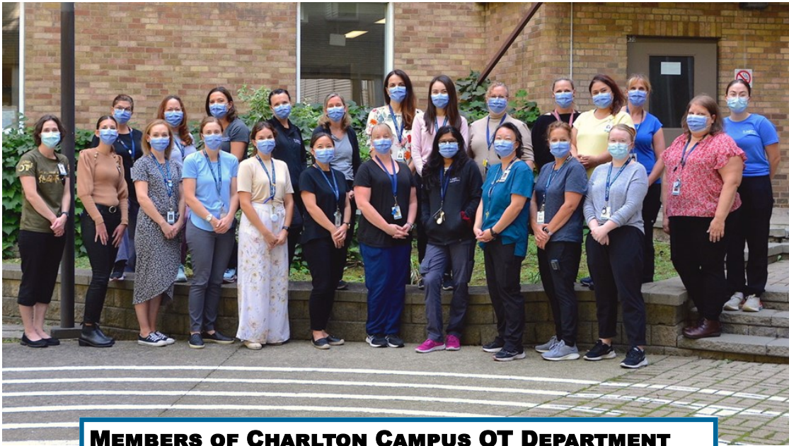
MEMBERS OF CHARLTON CAMPUS OT DEPARTMENT