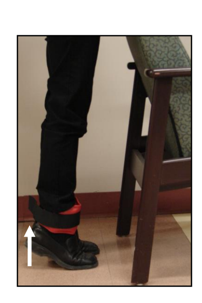
Start with feet flat on floor