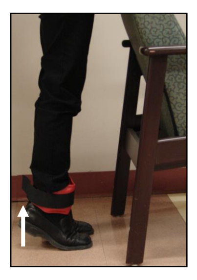
Lift heels up.