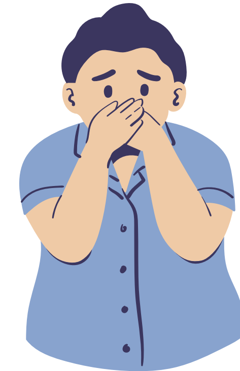
Diarrhea, nausea, vomiting