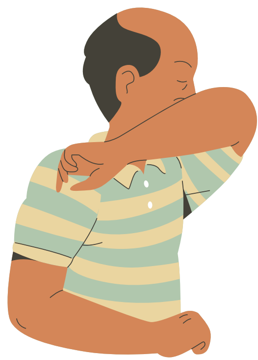
New or worsening cough, or shortness of breath