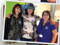
Jeans for St. Joe's